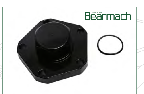
FTC859AB Drive Member and Nut H/Duty