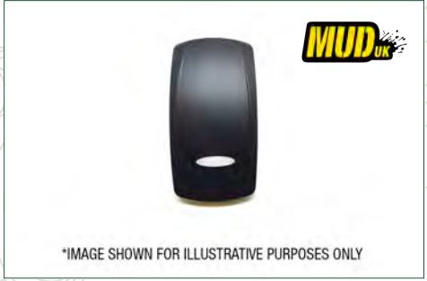
Carling Switches Ask your Account Manager for part numbers